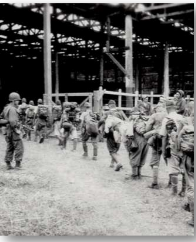
Japanese surrender at Negros