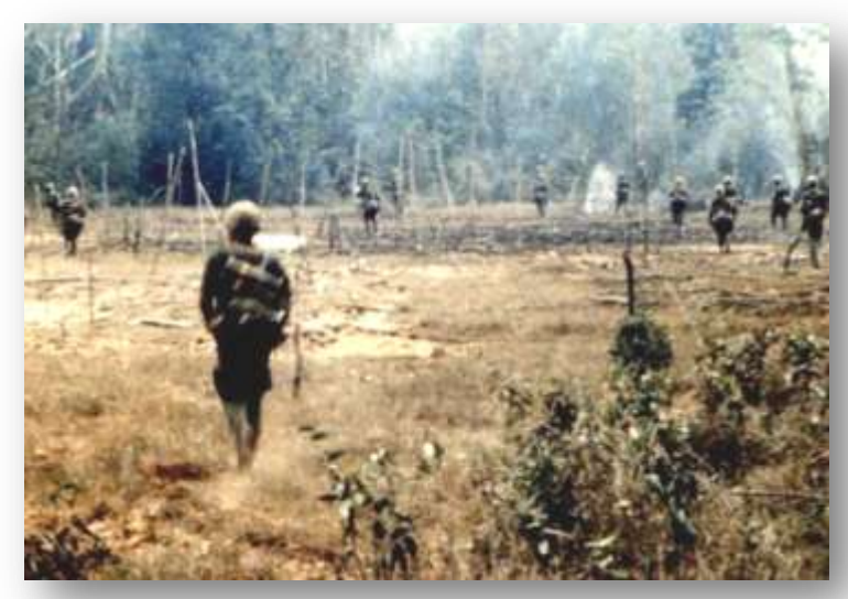
The 2/503d arrive LZ Zulu Zulu on 15 Mar 66 looking forward to a hot breakfast on the morning of 16 Mar. The bad guys are watching.

The 2/503d, the 2nd Battalion of the 173d, had been living on a diet of C-rations for days and its airborne "Sky Soldiers" were badly in need of hot chow. My outfit--A Company, 82nd Aviation--carried troops to and from fire fights, provided medical evacuation services and kept a steady resupply of ammo, "C" and "A-rats," water, mail and, on rare occasions, ice to our groundpounding brothers-in-arms. This morning, we were scheduled to deliver a hot breakfast and drink-cooling ice.