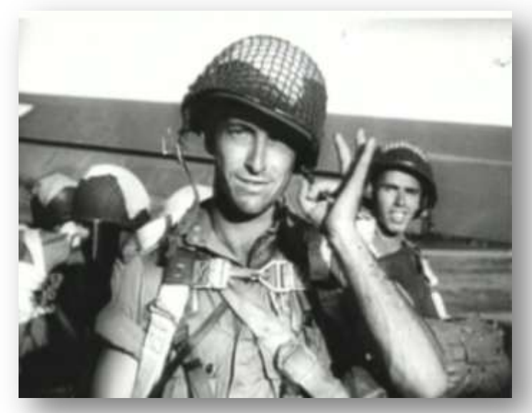
503rd troopers ready for Nadzab jump.

6. The 503rd engaged in fierce battles against frantic Japanese resistance in the mountainous areas of Negros for more than five months. The 40th US Division convinced higher headquarters there were only a few enemy troops remaining on the Island and were moved to Minanao, leaving the 503rd to battle the Japanese alone. At the end of the War with Japan in August 1945, about 7,500 of the surviving Japanese troops surrendered to the 503rd Parachute Regimental Combat Team. Official U.S. War Department sources estimated the 503rd killed over 10,000 Japanese troops during its combat operations in the Southwest Pacific.