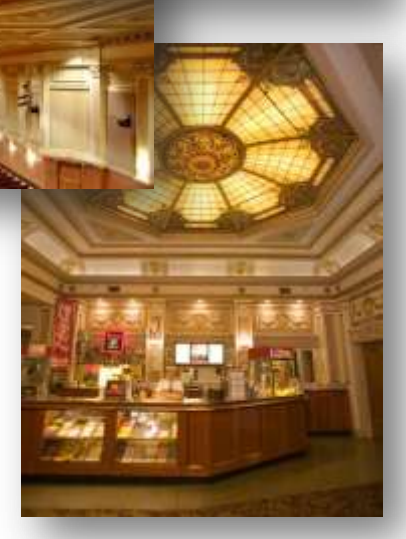
The concession area

Operation Corregidor II coming this month to the Kentucky