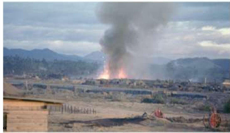
The enemy had blown-up the ammo dump and three C-130 aircraft on the airstrip."

Two more enemy assaults were made on A Company's CP before C Company would hook up with them. The NVA's 24th Regiment was well dug in and prevented C Company from linking up with the lost platoon. That night, while anticipating an all-out attack, the men heard shots punctuated by screams as the NVA executed the wounded. 43 out of 76 slain Sky Soldiers had fatal wounds in the back of their heads. (See Issue 29, June 2011 for a detailed report on The Battle of the Slopes ).