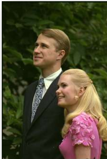
Edward Cox & Tricia Nixon