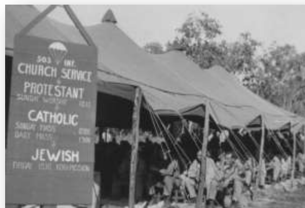
Church tent in New Guinea