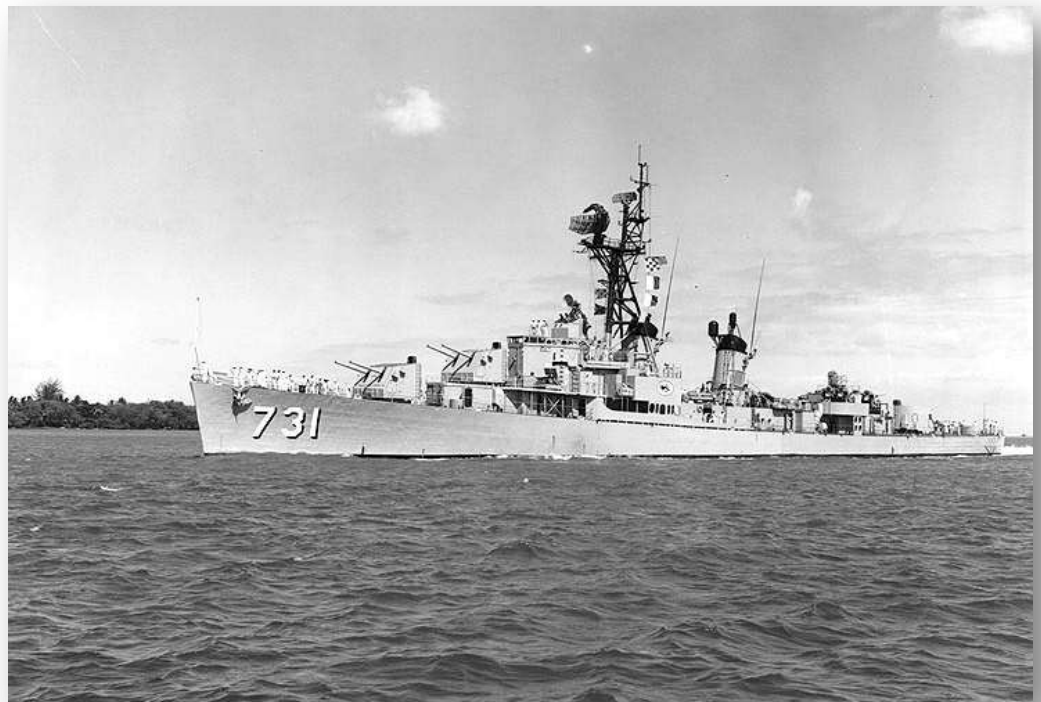
USS Maddox entering Pearl Harbor, Hawaii, 15 August 1966