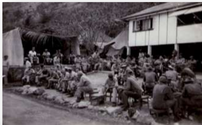
503 rd troopers mixing with the Aussies

Australia on 2 December 1942 after a voyage of 43 days and 42 nights. Later the Regiment was expanded into a Combat Team with the assignment of the 462d Parachute Artillery Battalion on 29 March 1944 and the 161st Parachute Engineer Company on 13 September 1944.