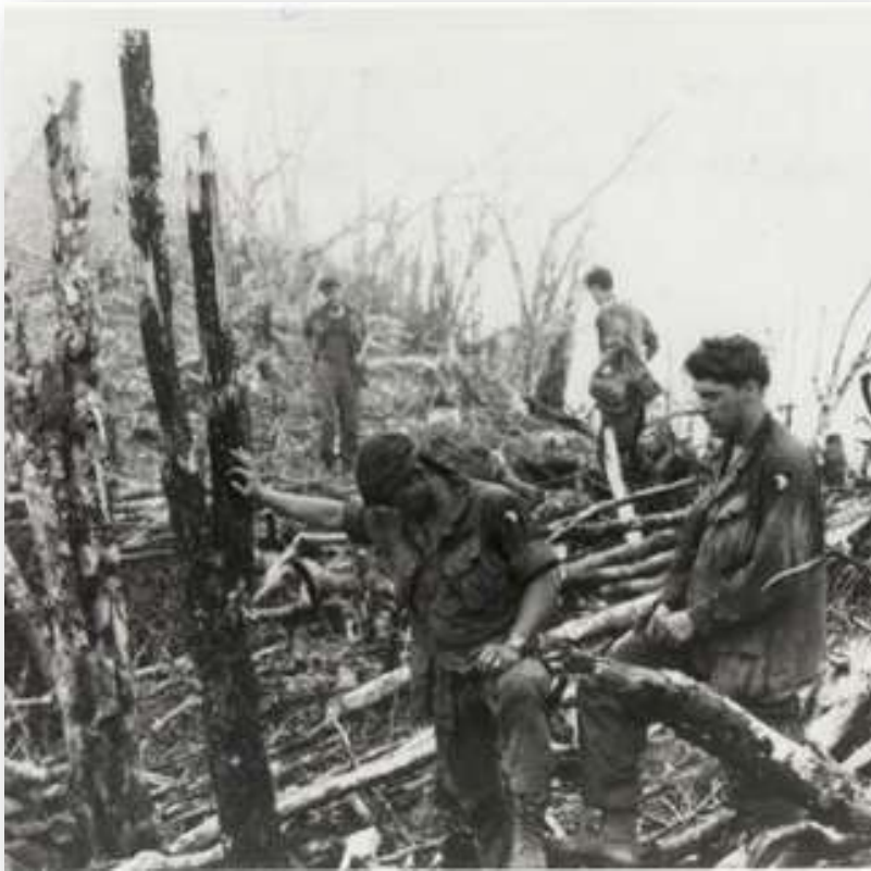
Screaming Eagles capture Hamburger Hill, only to give it back....SOP.

20 th : US troops capture Hill 937, Hamburger Hill, Vietnam.