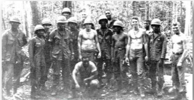
What was left of the 3rd Platoon, A/2/503d. Operation Yorktown, 6/23/66 -7/8/66, Xuan Loc Province, RVN.