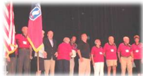
Honoring those 503 rd super troopers at 173d reunion in Myrtle Beach, SC, 2010.