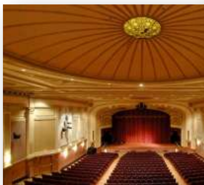
The present Kentucky Theatre auditorium