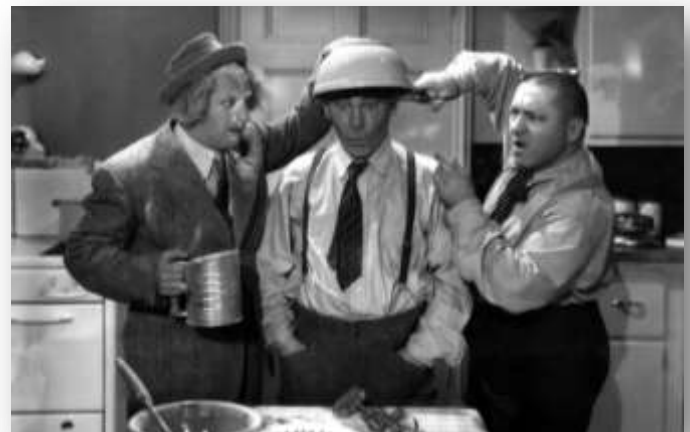
Larry, Mo and Curley

4 th : Moe Howard, [Moses Horowitz], comedian (The Three Stooges), dies at 77.