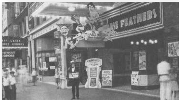
Publicity stunt for an early "talkie" featuring The Marx Brothers.

We hope you enjoy this brief look at her history and join us soon to continue the tradition by making some memories of your own.