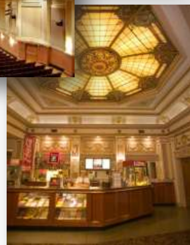
The concession area

Operation Corregidor II coming next month to the Kentucky