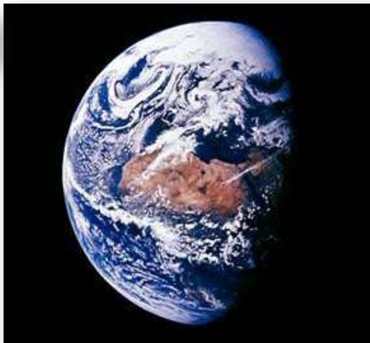
Apollo 10 photo of our home

10 th : Apollo 10 transmits 1st color pictures of Earth from space.