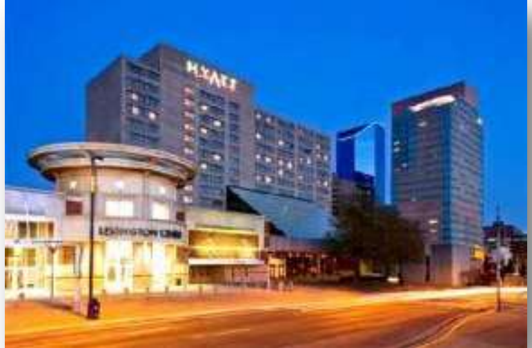
The Hyatt....Reunion Central

The centerpiece of this year's reunion includes Operation Corregidor II , an interactive presentation by paratroopers of the 503 rd PRCT who fought in the Pacific during WWII. The unique venue selected for this historic event will be the Kentucky Theatre, a short walk from the hotel. Following their remarks and a brief video presentation of the 503 rd from WWII, we'll open the floor for some Q&A. We hope you will be sure to attend this once-in-a-lifetime event and personally meet these men of the Greatest Generation during the reunion. The 173d will further honor these troopers at the closing banquet.