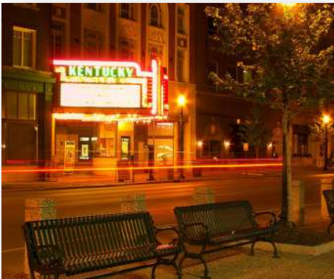
The Kentucky Theatre, site for Operation Corregidor II

Please visit our reunion website at: http://www.skysoldier17.com/Reunion.htm